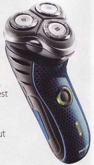
SensoTouch 3D Shaver , from $230, Philips

In the interest of making your shave as simple as possible, Philips has designed its smartest electric razor ever, the SensoTouch 3D . Shave wet or dry, with or without shaving cream and never worry about nicks as 3-D contouring and a flexing, tilting and pivoting head effortlessly adjust to dips, bumps, curves and any other character your face offers up.