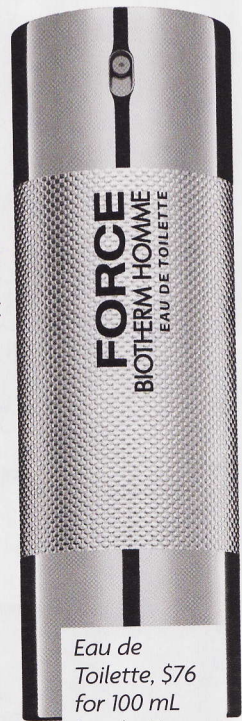
Eau de Toilette , $76 for 100 mL bottle, Force Biotherm Homme

Biotherm's newest fragrance is shaped by the interplay of opposing elements: modern and classical, dynamic and stable, soft and unyielding. An invigorating initial gleam of citrus gently floats into deep, masculine notes of cedar and Haitian vetiver, carried by a bracing spring water breeze infused with neroli, spicy cardamom and an artistic note of absinthe. —Evan Rosser